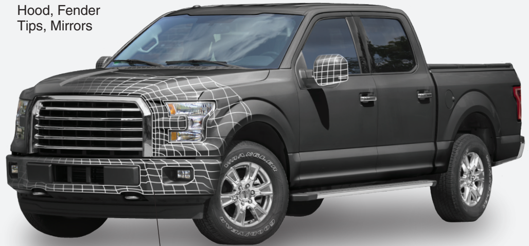
Z-Shield® is Optically Clear

Hood, Fender Tips, Mirrors, Front Bumper